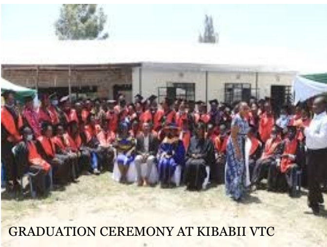
GRADUATION CEREMONY AT KIBABII VTC