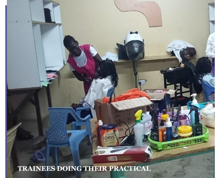
TRAINEES DOING THEIR PRACTICAL