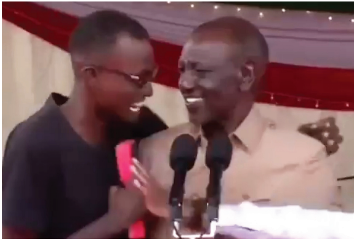
This image from a video grab shows the young man who stormed the dais as William Ruto delivered a speech in Ganze, Kilifi County, yesterday.